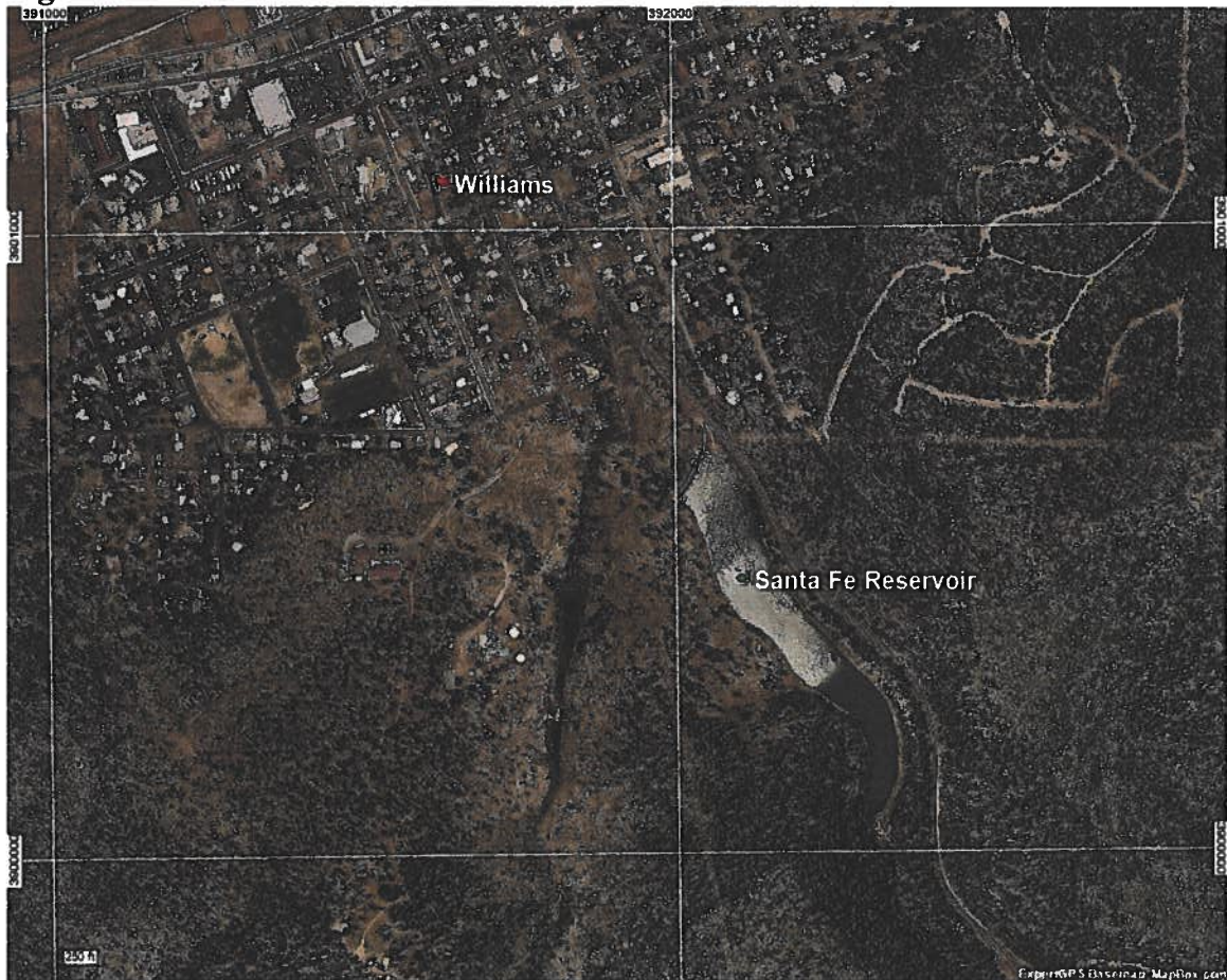
Figure 1. Santa Fe Reservoir Aerial Photo.

Santa Fe Reservoir is located southern edge of Williams Arizona (UTM 392120, 3900445).